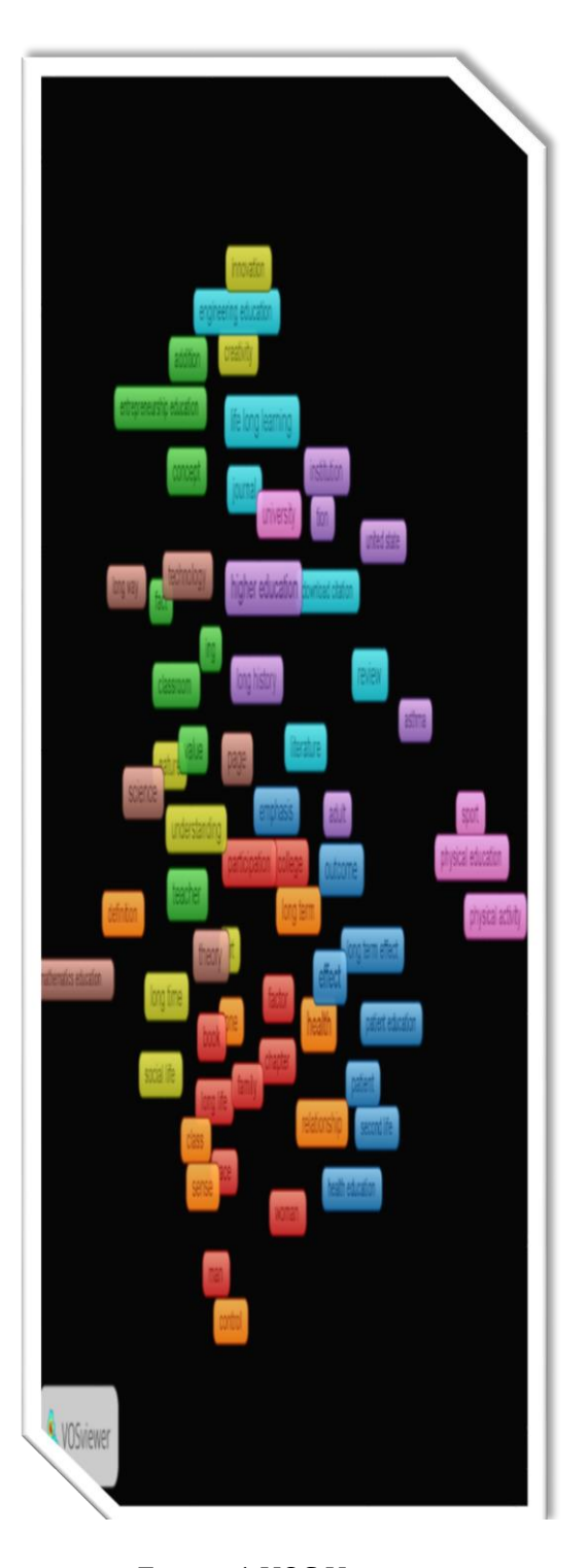
Figure.1 VOS Viewer