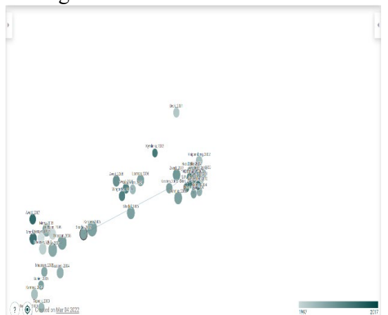
Figure 1. Connected papers of authors about Islamic religious education

The academic approach model in implementing FDS decisions requires good techno, psychological, local wisdom, and intellectual readiness for students. A learning outcomes orientation increases interest and learning talent in advanced students [2]. One of the spectacular ideas offered to increase interest and talent continuously is the implementation of FDS decisions through writing disclosures.