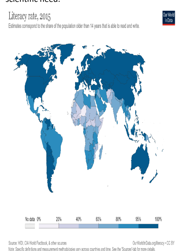
Figure 2. Literacy, 2015

Indonesian language. Therefore, maintaining the existence of the Indonesian language is an obligation for the Indonesian people, especially for a student or a party related to educational institutions. The foreign language used in education is actually only an introduction to science itself. That is, the thing that must be pursued is knowledge, not about the language so as not to be influenced by foreign languages, especially English which can have bad consequences if you can't filter it. This is a scientific need.