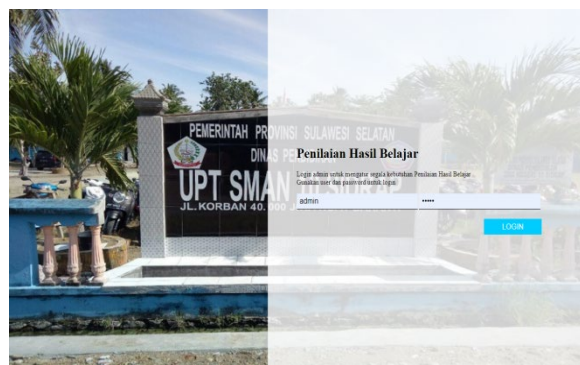
Figure 1. Initial view of admin user CBT

This stage is the process of inputting the assessment instrument into the form of a computer-based test in the form of a Computer Based Test (CBT) as a learning outcome assessment tool. This Computer Based Test (CBT) has an offline feature so that there is no need to access the internet which can consume a lot of network data usage, besides that it is also equipped with several components that can make it easier for teachers to efficiently recapitulate final grades. This CBT application can minimize the school's budget for spending funds which in the previous year cost a lot because it was still in the form of a paper test. The following is a CBT product display as follows: