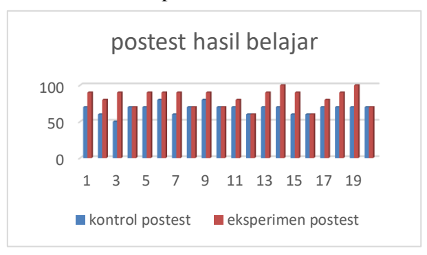
Diagram 2 Posttest control class and experimental class

The results of the posttest bar chart in the control class and experimental class above, it can be explained that the value of the experimental class was much improved by using the CTL learning model.