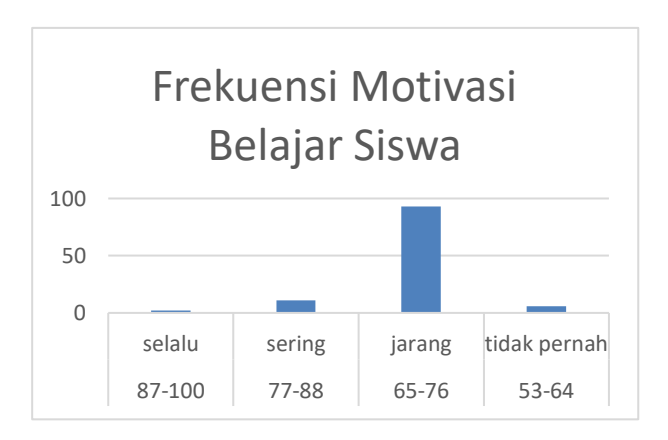
Figure 2 Histogram of Learning Motivation Variables

Based on the histogram image above, it can be seen that the highest frequency is 65-76 with a rare category of 93 students. The frequency of the smallest value is 87-100 with always 2 students in the category. So it can be concluded that the learning motivation of fifth grade elementary school students in the Rappocini sub-district has a rare category, or is adapted to the material and learning atmosphere in the class.