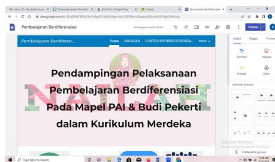
Figure 1. Media Front Page Google Sites Nailah

According to Haryanto (2017), Google Sites is a product from Google as a tool for creating sites, interesting to learn, free and easy to make. Google Sites allows users to collaborate in its utilization. Available online storage and can be searched with the Google search engine. Users can upload and download documents in various files easily. According to Nyoto as quoted (MF AK, 2021), what is interesting from google sites is that we can create a structured website with attractive accessories without having to have programming skills. All the process of adding pages can be done through an easy wizard process. With the provision of experience to be Google Certified Trainer (GCT) and often provide training on manufacturing Google Sites, then in assisting the implementation of this differentiated learning the author uses media Google Sites.