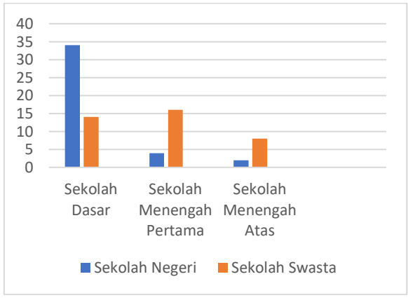
Jumlah sekolah menurut tingkat pendidikan di Kecamatan Tallo tahun 2022

The complaint submitted by HK is in line with data on educational facilities in Tallo Village. There are no state junior and senior high schools, and there are only three elementary schools. Meanwhile, data released by the Central Bureau of Statistics (BPS), in 2022 (5) the number of schools in Tallo District will be 29 schools, 48 elementary/equivalent schools, 20 junior high/equivalent schools, and 10 high school/equivalent schools. Data on the distribution of schools in Tallo District is not evenly distributed per sub-district. Specifically in Tallo Village, there are only 3 public elementary schools, 1 private middle school, and 1 private high school.