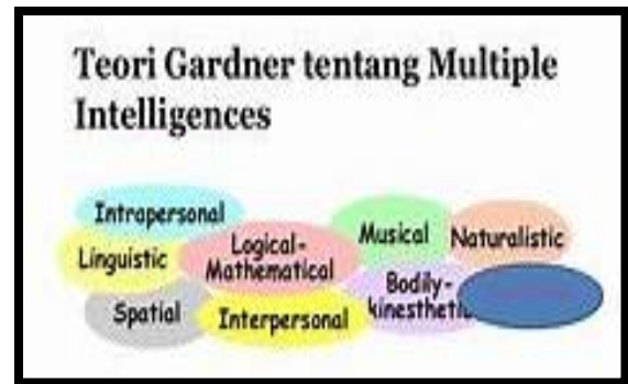
Picture 1. Multiple Intelligence