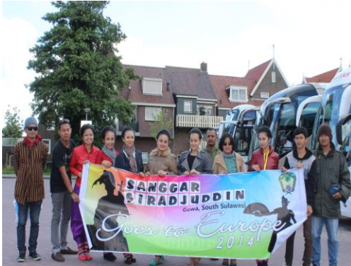
Figure 5. After the performance of the traditional Pacauren Dance, Donang Lea-lea and Pepe-pepe Baine Dance (Chandra 2014)

Tong-tong Fair event, The Hague, Netherlands in June 2014