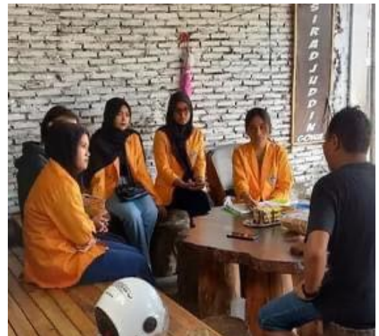
Figure 3. Interview with dance students at Makassar State University