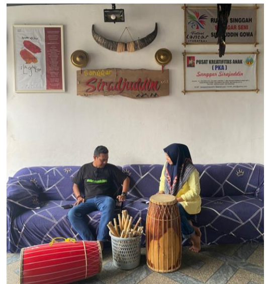
Figure 4. Interview with art education students at Semarang State University (Andi Tenri July Astari 2023)