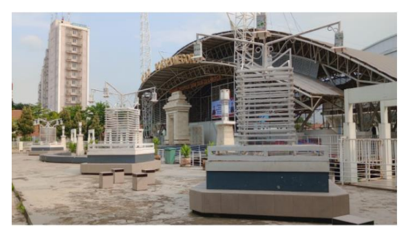
Figure 6. Application of the form of Damar Kurung in the architectural/building sector.

The aesthetic form of Damar Kurung can also be seen in front of the WEP building as an aesthetic support in the field of building architecture. The Pusponegoro Expression Forum Building (WEP) is a public facility located on Jalan Attorney General. This building can be called a multi-purpose building because it can be used for exhibitions, sports, vaccine services, car free days. The medium used is iron which is arranged to resemble the shape of a resin bracket and has a volume or three-dimensional work.