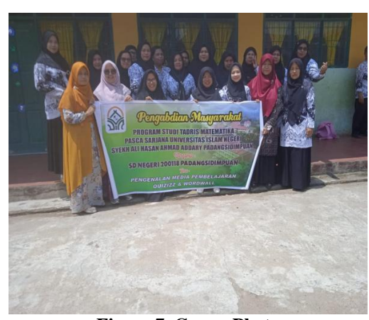
Figure 7. Group Photo

This training has a positive impact on partners as subjects of community service. According to interviews with teachers before the service event, many of them have not technology optimally used to create interactive learning, including the use of digital wordwall applications. However, after this training, it was seen that the teachers were now able to operate the wordwall application, create learning materials, and use this application as a learning evaluation tool. In addition, based on input from participants who want more similar activities, this kind of training is expected to be held frequently. With activities like this, teachers have the opportunity to develop and improve their knowledge and skills. Suggestions and input from these participants will become the basis for evaluation for future service activities.