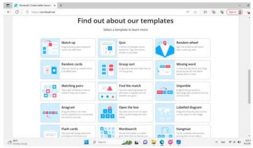
Figure 5. Wordwall Application Dashboard