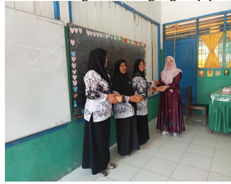
Figure 6. Appreciation from the Service Team

participated in the activity from start to finish. As well as closing and taking a group photo.