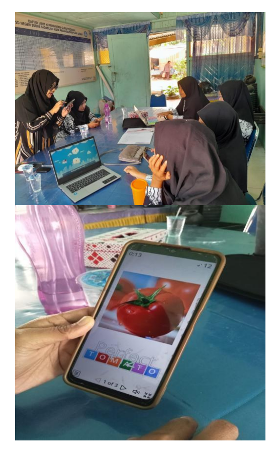
Figure 3. Teachers Practice Directly Using Wordwall