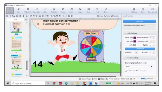
Example of steps to develop Flip PDF Corporate products by adding links for spin games

Example of steps to develop Flip PDF Corporate products by adding You Tube links for learning videos