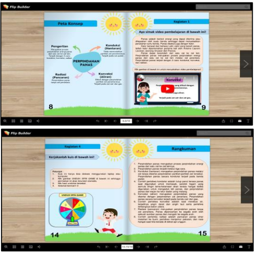
Figure 5: Example of some pages of the final model of the interactive electronic module

The evaluation stage is useful for assessing the suitability of product specifications (Sugiyono, 2019) and improve the electronic module product after receiving feedback (Kurnia et al., 2019) from thematic material teachers and grade V students. Can be seen in Figure 5: