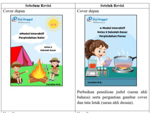
Figure 4: Example of one of the design revision steps