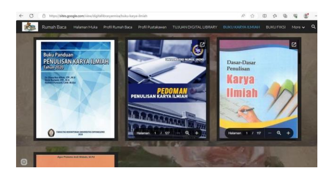
Figure 2 Book Contents View

Use analytical tools to track the performance of your digital reading house's content and materials. These can be used to look at metrics such as the number of visitors, time spent on site, and conversion rates to assess the effectiveness of your content strategy in your digital reading house. Then updating and adding new content to your digital reading home will keep readers interested and coming back for more.