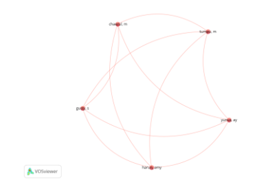
Figure 1. Co-Writing (Related)