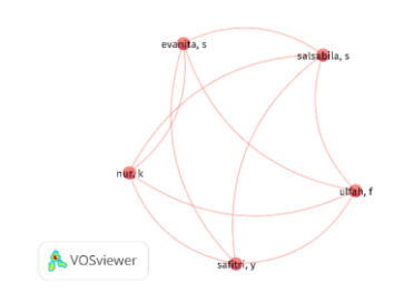
Figure 1. Co-Writing (related)