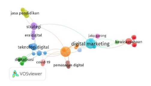
Figure 3. Co-Accurence (Keyword)