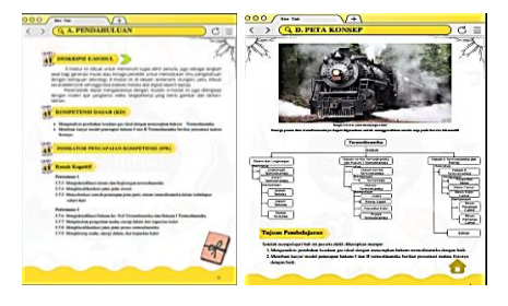
Figure 4 competency and concept map

flow of the product learning chapters is depicted in the concept map.